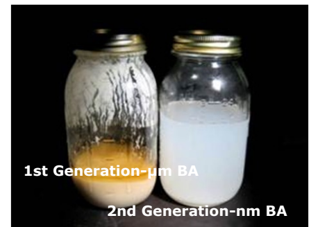
1st Generation-µm BA

In summary, BLI's Liquid Boron™ is an extremely low friction boundary layer lubricant that works synergistically with the lubricant delivery in vehicles (i.e. motor oil, manual transmission and gear/differential oils, diesel and gasoline fuels, hydraulic oils, etc.) improving the performance of the fluid lubricant, but not affecting the existing lubricant negatively. BLI's Liquid Boron™ is nearly permanent through its own self-replenishment properties and is active on virtually any metal surface. The boron bonding has a strong affinity to metal surfaces producing a boundary layer with a unique hardness just about the equivalent of diamonds.