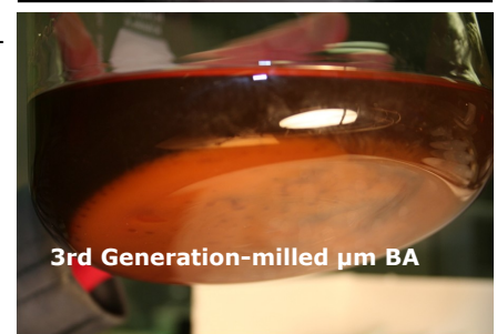
3rd Generation-milled µm BA

Prior generations of solid boron lubricant. Settlement can be seen.