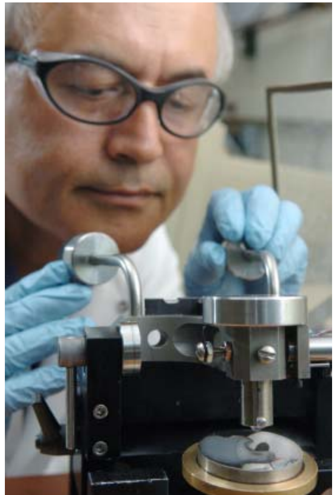
Argonne researcher Ali Erdemir performs a friction test on a metal disc coated with a solution of motor oil with nano-boric acid particles.

Reducing the size of the particles to as tiny as 50 nanometers in diameter – less than one-thousandth the width of a human hair – solved a number of old problems and opened up a number of new possibilities, Erdemir said. In previous tests, his team had combined the larger boric acid particles with pure poly-alpha-olefin, the principal ingredient in many synthetic motor